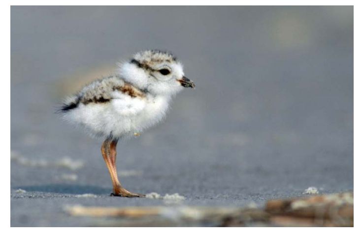
Piping plover chick

Attwater's Prairie Chicken Recovery Partnership - The partnership between NASA's Johnson Space