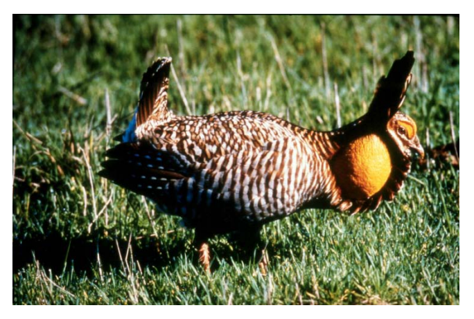
Attwater's Prairie Chicken

In order to achieve this objective, the captive breeding program must be expanded. One facility, Fossil Rim Wildlife Center, currently houses more than 50% of the captive Attwater's population. This presents a significant problem since a single catastrophic event or disease outbreak could wipe out that entire facility. This also is inconsistent with the Draft Attwater's Prairie-Chicken Recovery